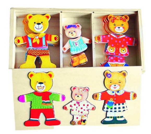
Figure 1. The puzzle used in the study. [Colour figure can be viewed at wileyonlinelibrary.com]

and initiated the free play session by leaving the game area. Each session ended either with experimenter's prompt at the end of 3 min or when children stopped being engaged with the activity and left the game area. Thus, even though a parent—child dyad could interact with the puzzle for 3 min, the sessions varied across dyads (M=186.53, SD=81.94, range = 70-377 in seconds). During a typical play session, parents aimed at engaging their children to play with the toy by talking, gesturing, drawing attention to the game area, and playing with the puzzle. All play sessions were recorded for later transcription and coding of speech and gestures.