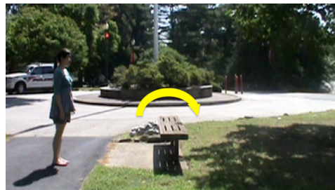
Figure 1: Sample stimuli from the experimental task. The picture is a still frame from the movie clip of a motion event: jump over. The yellow arrows indicate the direction of the movement.

Participants watched 20 dynamic movie clips, depicting different motion events with randomized combinations of 10 manners (hop, skip, walk, run, cartwheel, crawl, jump, twirl, march, step) and 9 paths (through, to, out of, under, over, in front of, around, across, into). The actions were performed by a woman in an outdoor area (see Figure 1 for sample stimuli).